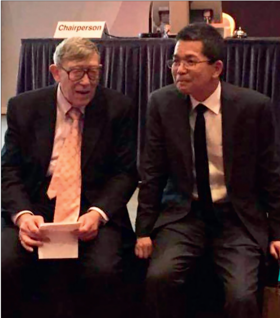
6 th World Congress in Sleep Medicine, Seoul, Korea, 2015.